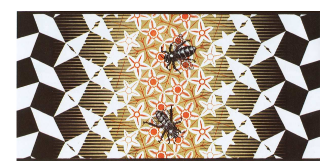
Fig. 2. A metaphor of the adaptationist solution to Fermi's paradox: emergence of complexity crowned by society (of social insects!) from the simple pattern, followed by reverting to simpler, but more stable forms (imagine the time flowing along the added horizontal axis). This is a section from the three-color woodcut Metamorphosis III which Escher finished (after considerable delays and even reluctance, as described in his diaries) in 1968. The metaphor is limited by the fact that the final state of the direct adaptation is not the mirror-image of the original pre-intelligence state ("evolution doesn't repeat itself").

tation ("crocodiles returning"). The second transition is much slower and might be occassionally interrupted or arrested; yet, the general trend toward return to direct adaptation is inescapable. This bifurcation is, in this view, tantamount to extinction of the original intelligent species, and its remains are gradually submerged into the general astrobiological "noise" of the Galaxy. The transient nature of the phase of technological adaptation constitutes the bulk of the "Great Filter" explaining the silentium universi . A colorful metaphor of the rise and fall of such advanced technological communities can be found, for instance, in a piece of the 1967-68 woodcut Metamorphosis III by great M. K. Escher (Fig. 2).